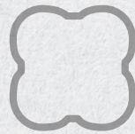
Special Square – SPS