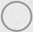
Round – R